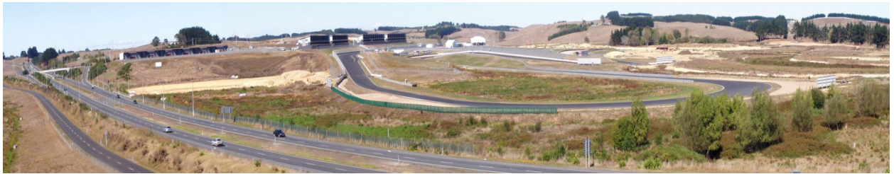
Photograph 2: During construction, showing extensive modifications of Motorsport catchment.