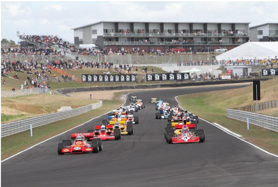
Photograph 3: National circuit opened 24 January 2010.