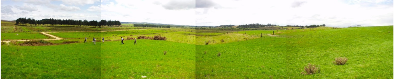
Photograph 1: Pre-development situation – farm land.