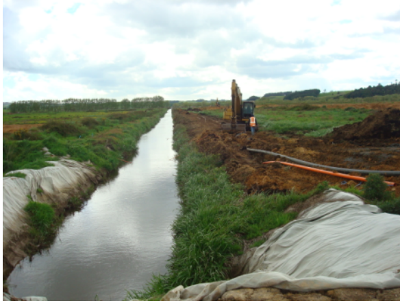
Sealed manhole system utilised

Low lying areas with peaty, compressible soils and high groundwater and surface water levels.