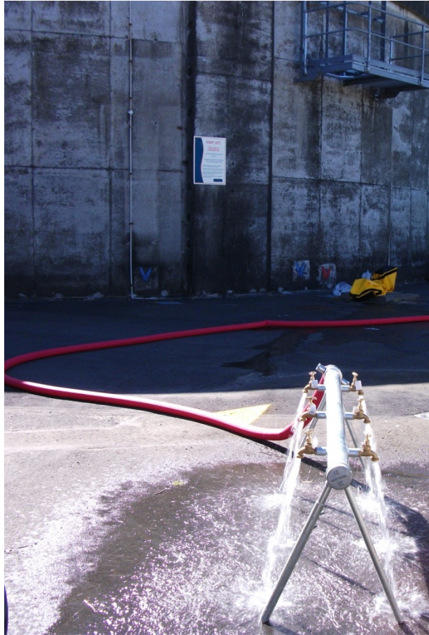
Figure 1: Capacity Emergency Manifold Stand at Reservoir