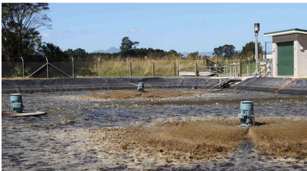
Photograph 2: SBR Plant in Aeration Phase

Photo 2 shows the SBR in AERATE phase with the control room and the biogas flare unit in the background.