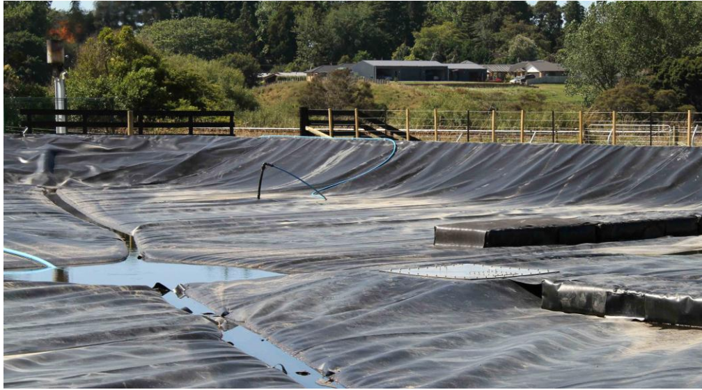
Photograph 1: Part of Covered Anaerobic Plant with Biogas Flare in Operation

The SBR was designed with a combined FILL/AERATE cycle of 6 hours, with FILL stopping once a set volume was transferred from the covered anaerobic lagoon. The aeration is controlled either by dissolved oxygen (DO) management or pH management. Following the aeration, a SETTLE phase of 1 hour is provided, with a DECANT cycle of around 5 hours. The aeration requirement is based on managing the BNR process, with 66 kW of mechanical aeration capacity installed (additional provision of 22 kW provided for future). The SBR operates on a two 12-hour cycle per day regime with volume controls as being the primary controller and level controls as the secondary control. When the aeration demand is reduced, then a dedicated mixer starts automatically to ensure that the SBR mixed liquor remains in suspension.