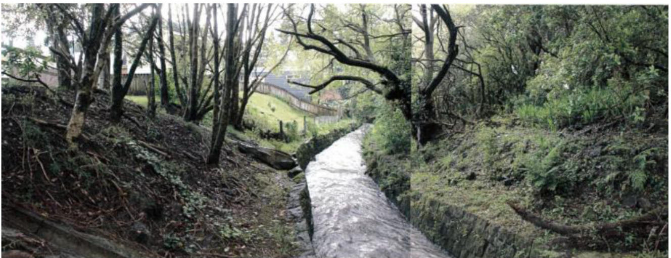
Figure 2: Example of potential stream widening and amenity access along Meola Creek.