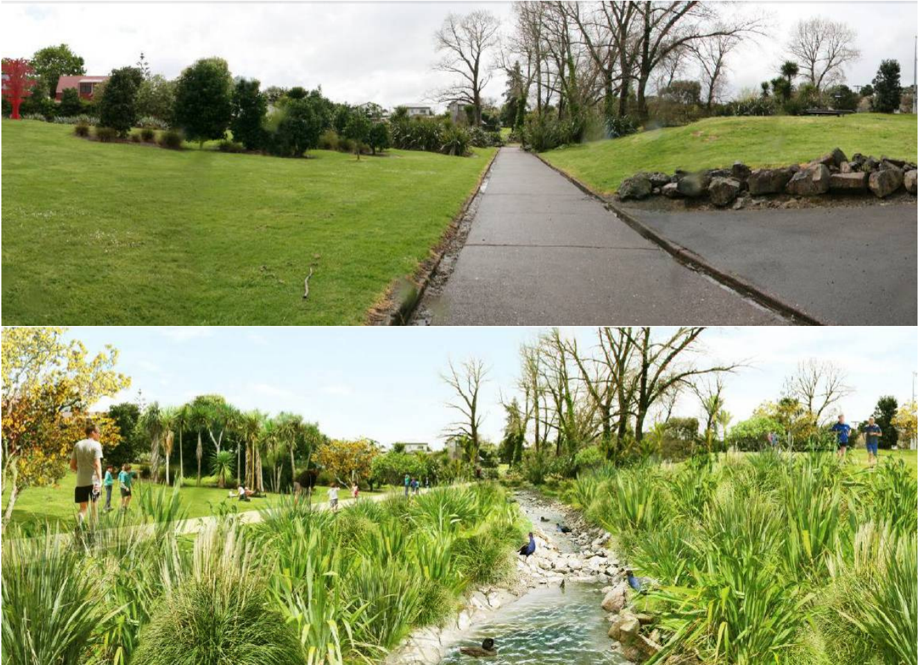
Figure 4: Example of potential daylighting opportunity within Meola Creek.