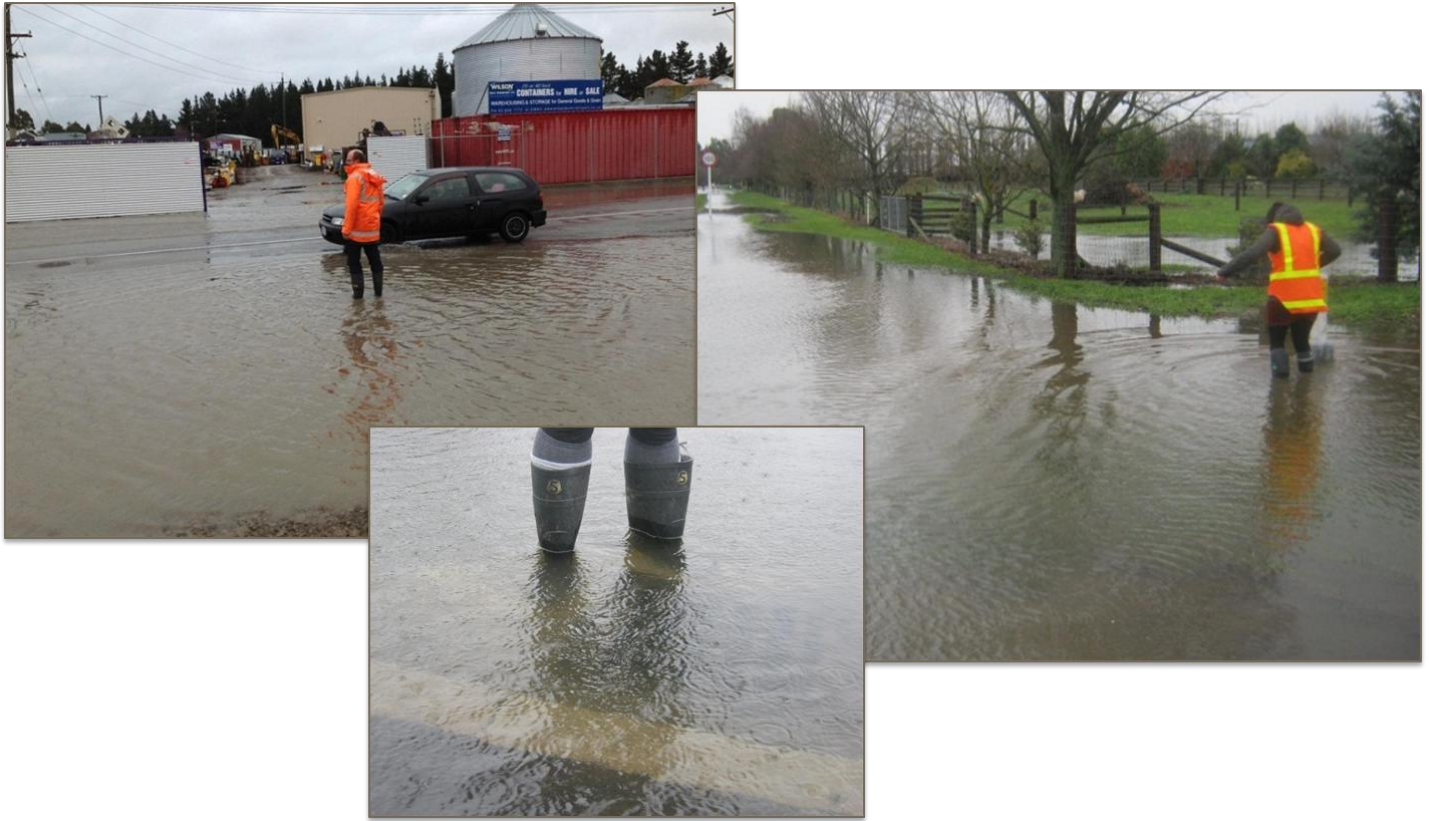
Photographs 1-3: The "Gumboot Test"