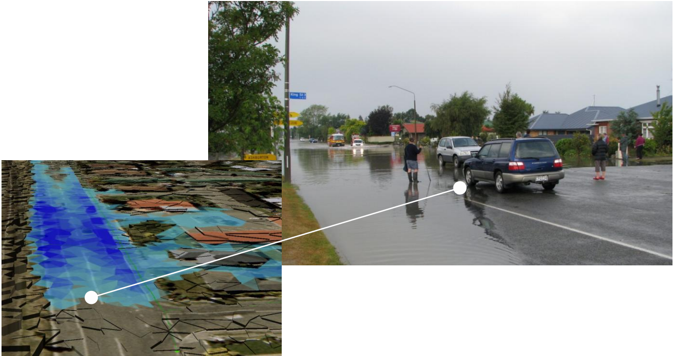
Figure 3: Example of information presented to Council showing good correlation between model outputs and actual flooding observed.

Outputs from the model were presented to council showing animated themed flooding overlaid on aerial photography or 3-dimensional models based on LiDAR and aerial mapping. These visual outputs were paired with photographs of actual flooding to demonstrate the models value.