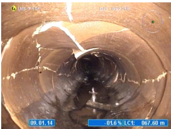
Figure 2 Longitudinal/circumferential failure