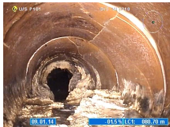
Figure 3 Fat Deposits

Additional to the pipe's state of disrepair was evidence of a combined sewer that prevented the CCTV from going any further due to fat deposits (Figure 3). These deposits