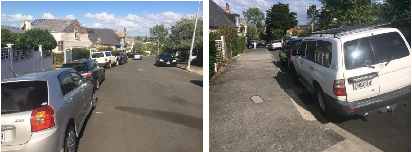
Figure 3: Congested streets with vehicles parking over catchpits

From a broader environmental perspective, increased stormwater run-off from new housing developments is impacting on stormwater management. And with climate change predicted to increase occurrences and intensity of rainfall events, greater overland flows are likely with the potential for increased private property flooding. This has implications for controlling peak flows and contaminant discharge to receiving environments, and increases the likelihood of conflict with community expectations.