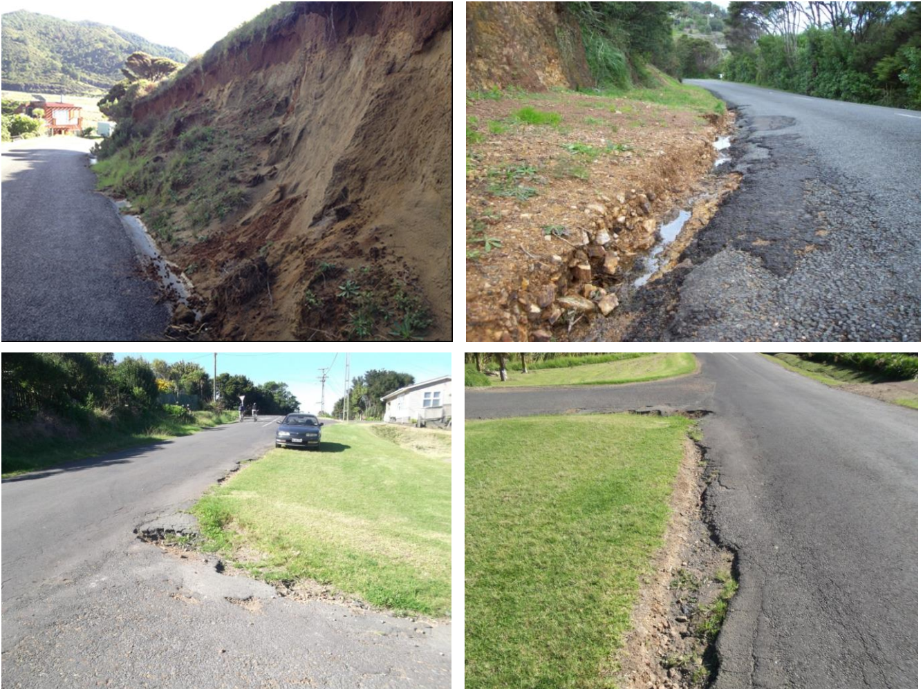
Figure 2: Gulf Island Bank Erosion, road scabbing, scour and stormwater inlet issues

Environmental Sustainability – Minimise network stormwater pollution. Eliminate RMA non-compliance with a service measure of compliance with environmental standards for water pollution and percentage coverage of environmentally significant catchments with appropriate treatment.