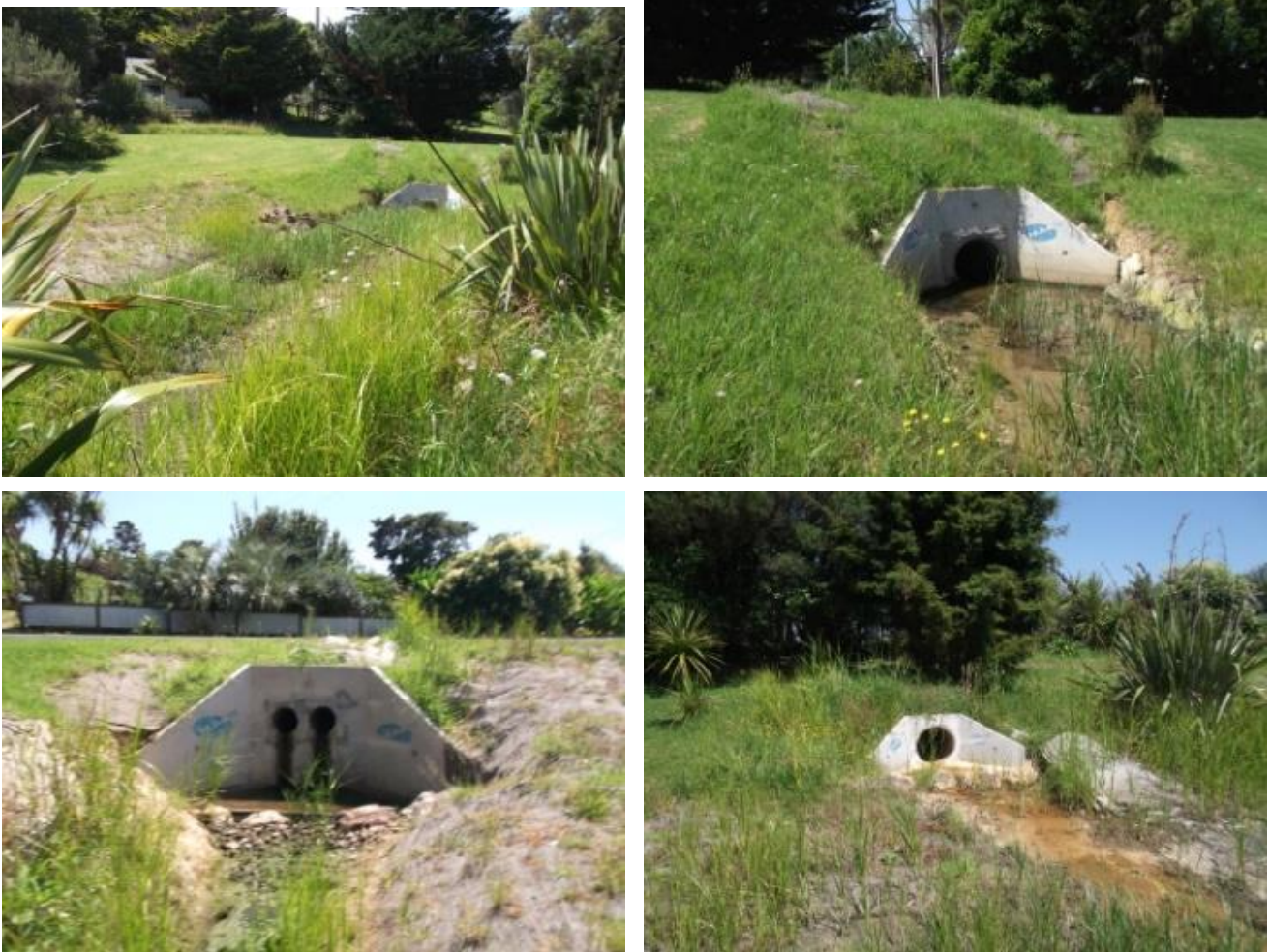
Figure 9: Detention Basin clearing and inlet/outlet protection

GHD, Auckland Transport and Auckland Council SW have been proactive in managing the Gulf Island issues through improved inlet/outlet protection, installed structures to minimise erosion at outlets and maintain flow conveyance, installation of low cost treatment devices to manage pollutants and blocked catchpits, instigating cleaning and maintenance regimes for detention basins and open channels to remove litter and excess sediments, trimming vegetation and grasses and maintaining capacity including scour protection.