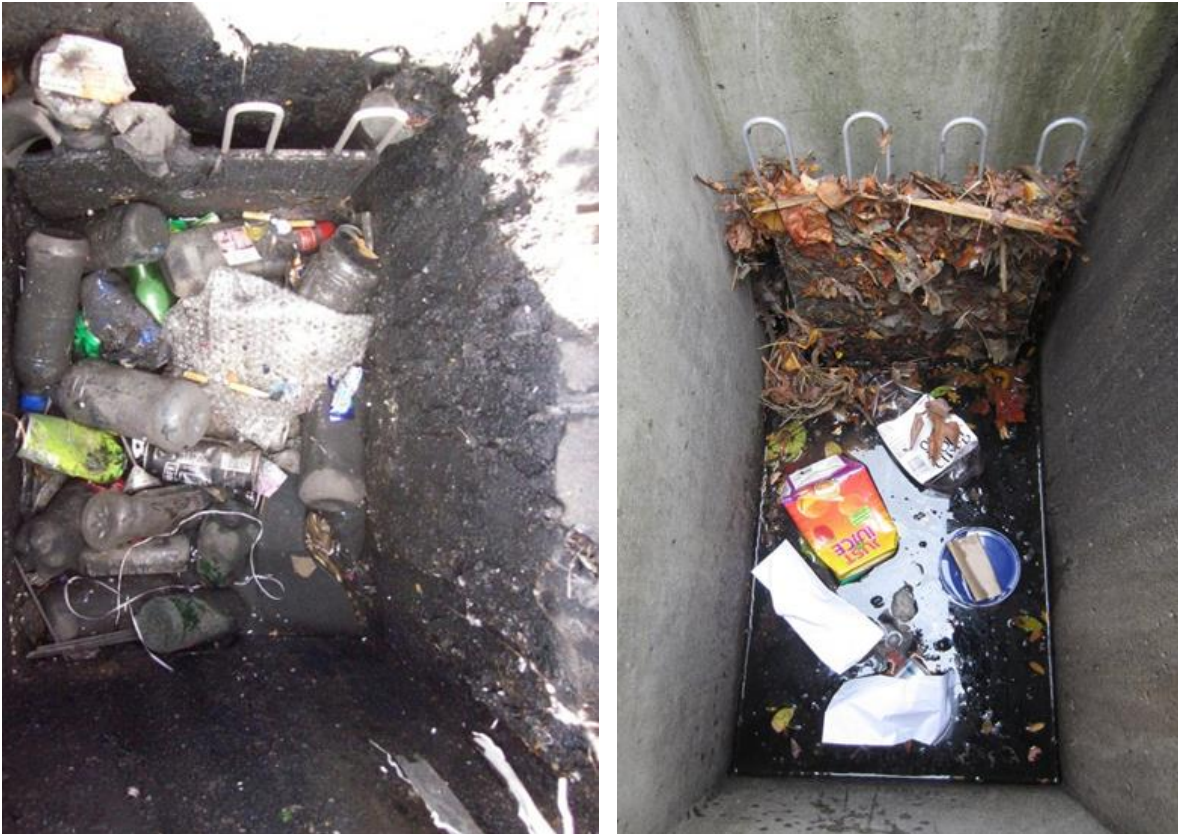
Figure 8: Catchpit Pollutant Trap installed in Catchpits