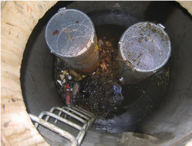
Figure 5: Soakhole with GHD Filter cage