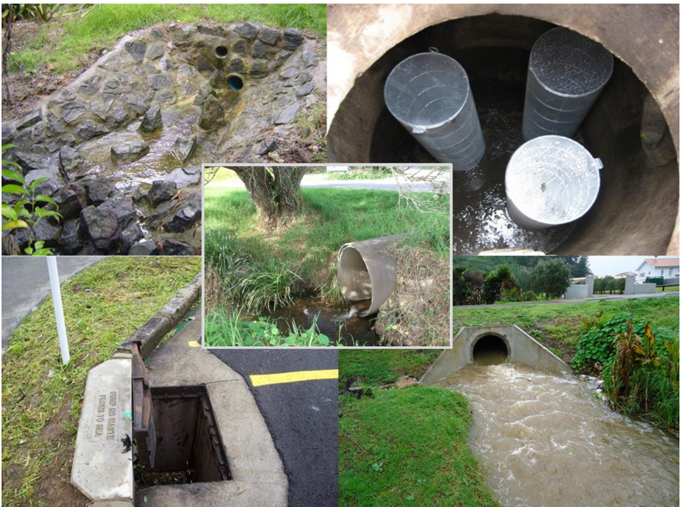
Figure 1: Auckland Transport Stormwater Assets

The benefits of this programme are potentially wide reaching, as it is not only of value to Auckland Transport and other stakeholders in Auckland who are responsible for the quality of the receiving environment but also to environmentally aware Transport entities anywhere.