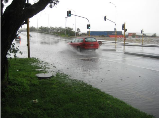
Figure 4: Carriageway Flooding