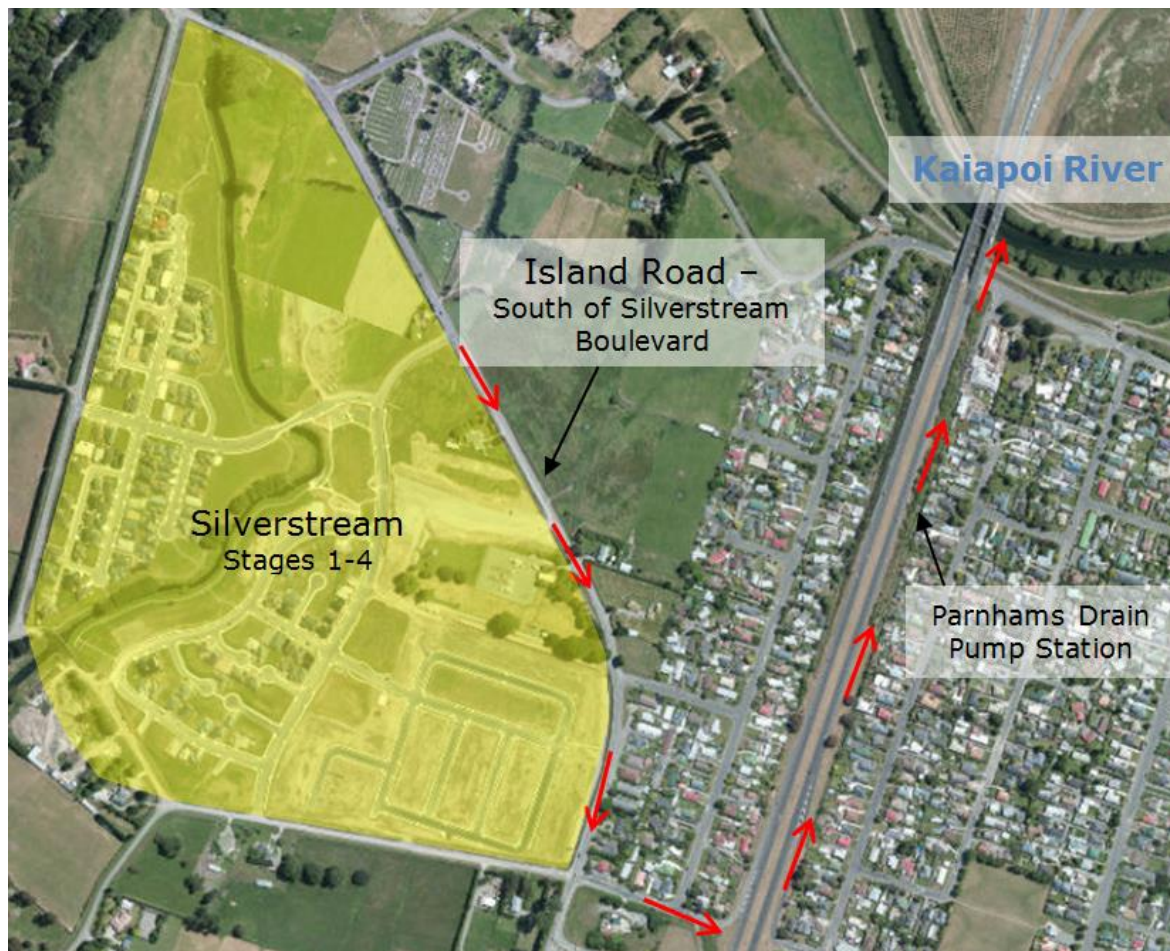
Figure 4: Island Road Stormwater System – WDC Network