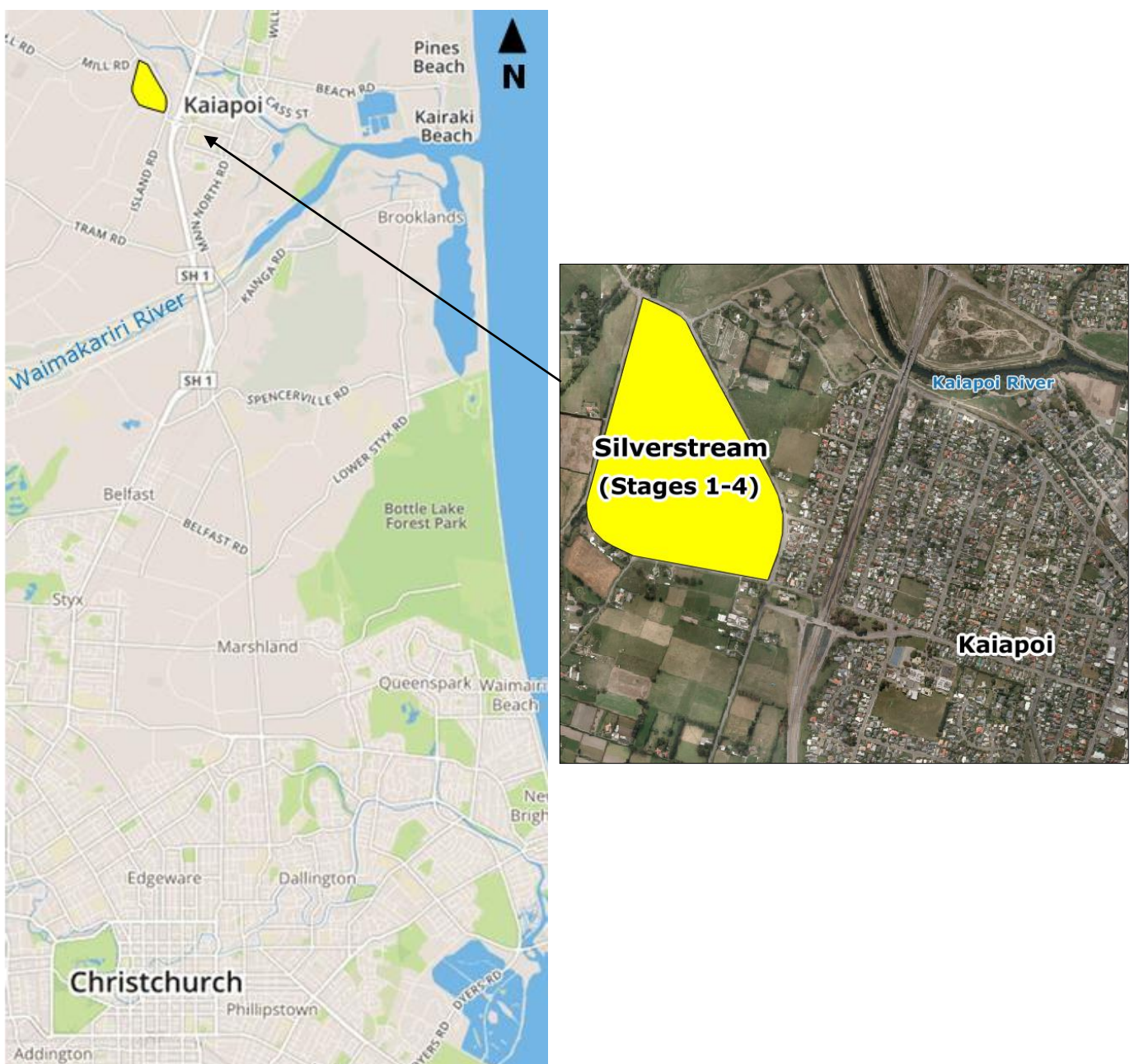
Figure 1: Location of Silverstream Residential Subdivision

Although the land was approved for development, it was still necessary to obtain the relevant consents. With respect to stormwater related activities, consents were required from Environment Canterbury. The requisite resource consent application and assessment of environmental effects were prepared and consents were granted for the stormwater discharges from Stages 1 to 4 of Silverstream to the Kaiapoi River in 2012. The location of the subdivision is shown in Figure 1.