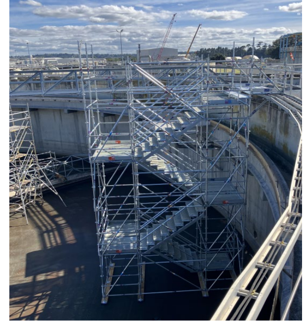
Reactor & Clarifier (6.5+m deep) New scaffold tower with 4 flights of 1.4m wide stairs