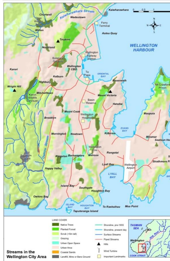
Figure 2: Streams in the Wellington City Area

Having just hosted the Stormwater Conference 2023 in Tāmaki Makaurau (within catchment of the piped Waihorotiu Stream) there was a desire from delegates to better embed the principles of Te Mana o te Wai into the urban context and to ensure regulation provides a driver to seek improved outcomes for freshwater whether in open or piped streams.