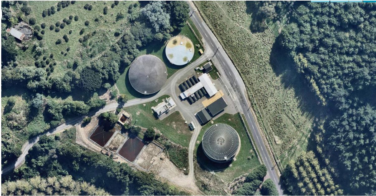
Figure 3: Levin WTP, Aerial

The treatment now consists of a surface water intake via infiltration gallery, raw water pumping to the plant, clarification by actiflo including applicable chemical dosing, media filtration, UV disinfection, post treatment chlorine dosing and storage. As noted before, the UV unit can also be used for taste and odour control although this has not been required so far. Waste treatment utilizes the old settlement ponds and dewatering is provided by a geobag with filtrate returned to the Ōhau River.