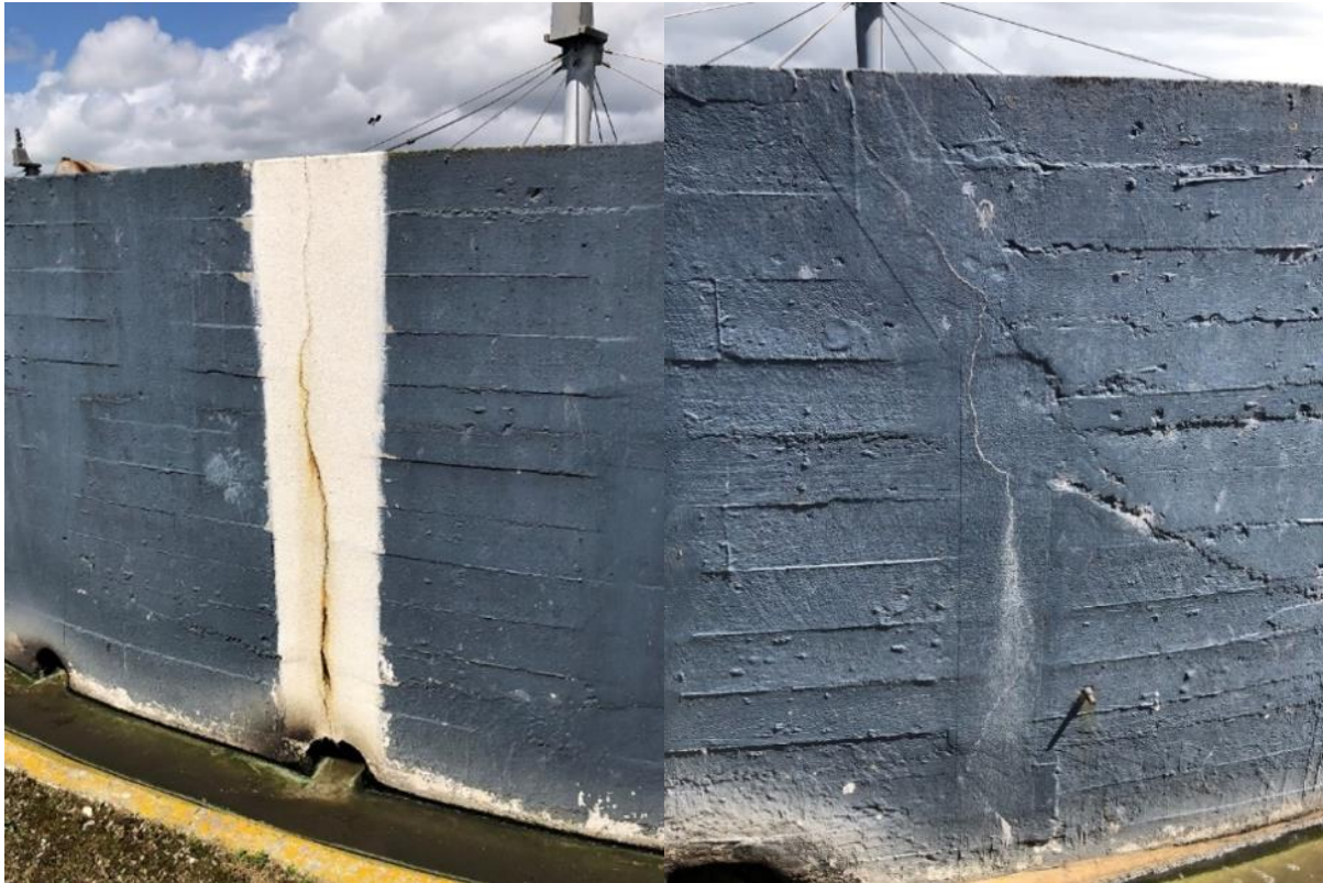
Figure 1: Tricking filter showing structural condition