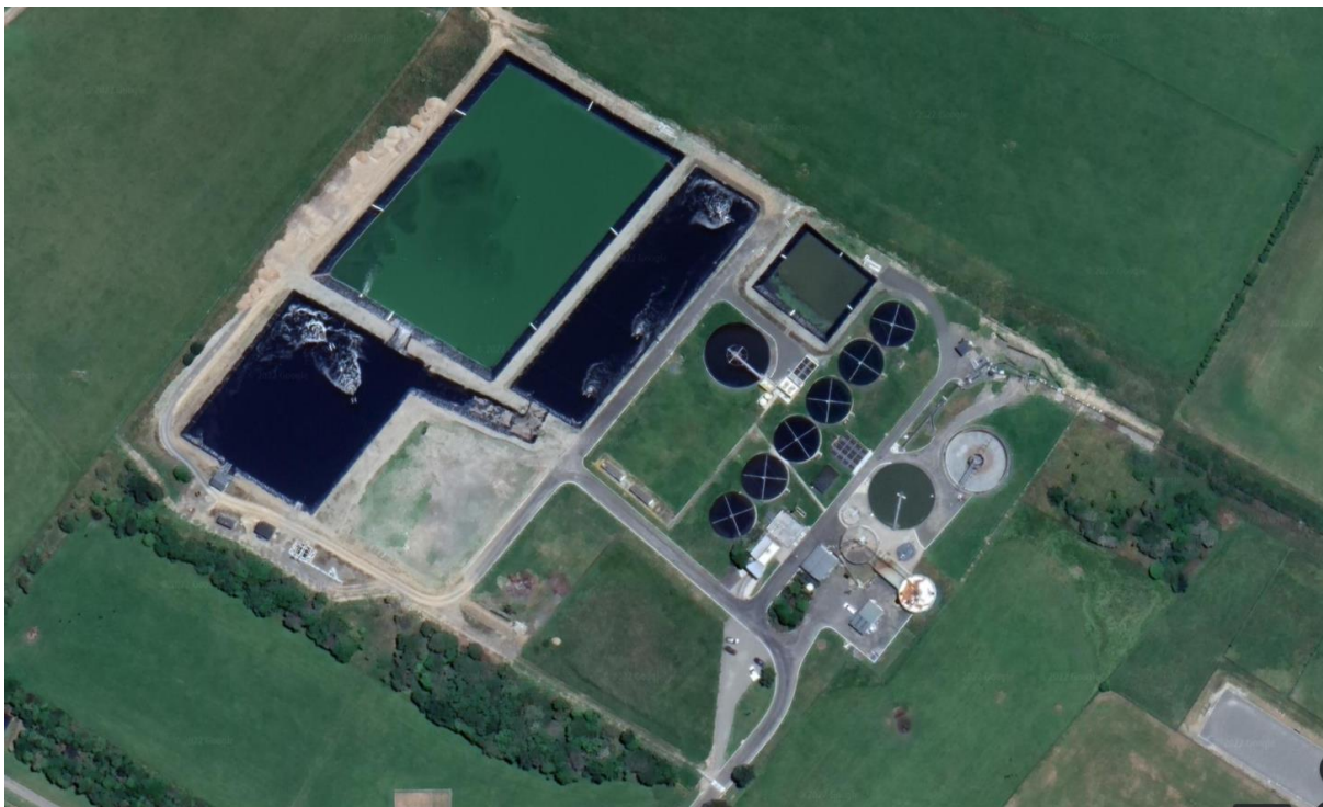
Figure 1: Levin WWTP, Aerial

The Levin Wastewater Treatment Plant (WWTP) started construction in its current form in around 1967. Further modifications were made in 1971 (operations building), 1990 (solids contact process) and 1996 (second primary clarifier, anaerobic digester and sludge tank). A new effluent pumping station has also been constructed within the last 10-years.