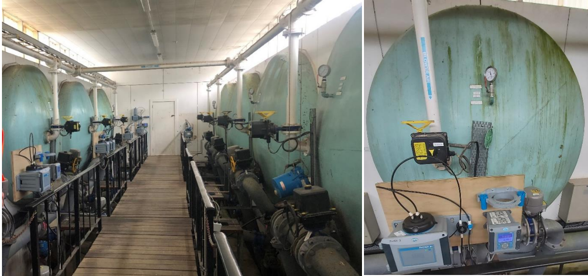
Figure 2: Pressure filters at Levin WTP