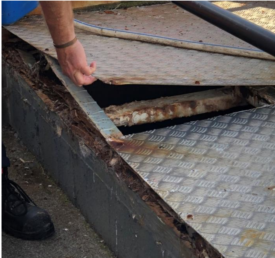
Figure 5: Deterioration of Sludge Storage Tank Roof

The following are key findings in this assessment for the WWTP and WTP.