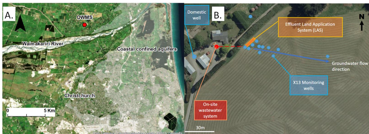
Figure 1: A. Location of the study site in Eyreton, north Canterbury; B. Site layout.

The pilot tracer study site is located in North Canterbury and 13 groundwater monitoring wells support the investigation at the site (Figure 1).