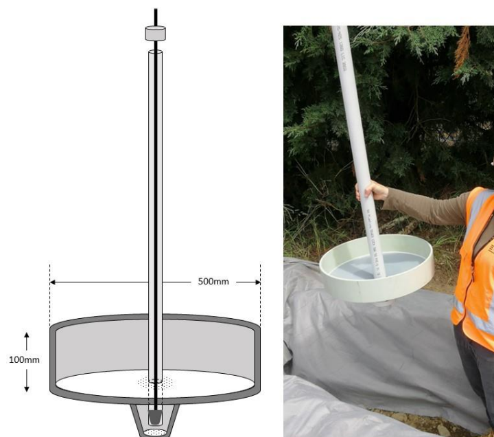
Figure 3: ESR designed in-situ vadose zone sampler.