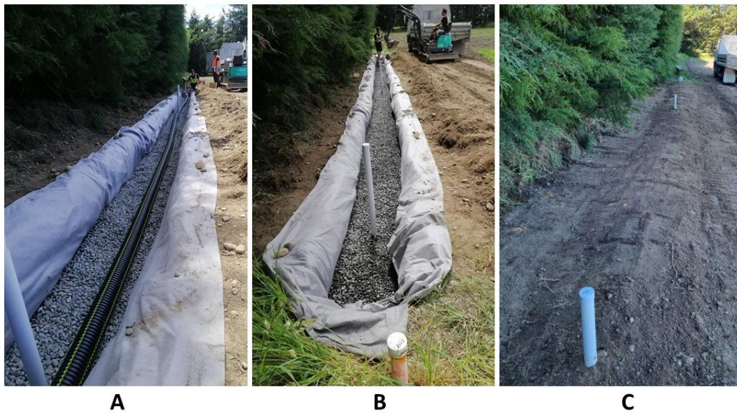
Figure 2: A) 40mm diameter PVC delivery line incased in 100mm diameter Novaflo pipe, B) trench filled with AP20 washed river gravels, C) completed conventional trench covered with topsoil.

as plaque forming units (PFU) per ml. The detection limit was 1 CFU or PFU per ml.