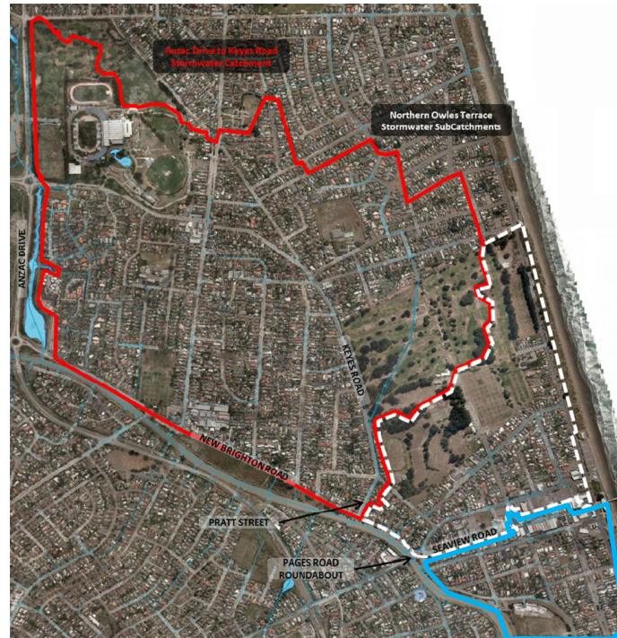
Figure 1: New Brighton Road and Owles Terrace Catchments

Following development of the concept design, the detailed design stage of these catchments was broken into two separate projects: the ‘Northern Owles Terrace Catchment’ and the ‘ANZAC Drive to Keyes Road Catchment’, although the latter project has been placed on hold.