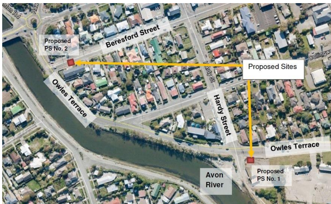
Figure 4: Stormwater Pump Station Plans

Modelling of the two stations under these various scenarios allowed the control philosophy reduction of each station from 1000 l/s to 800 l/s. This also proved that two smaller stations within the catchment, rather than one larger unit, provided significant savings in capital investment in the conveyance network.