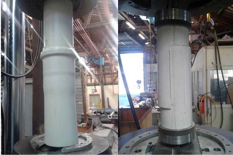
Figure 5: Over-inserted PVC DN160 pipe during testing (left) and fractured PVC DN200 socket (right). The degree of over-insertion is similar but the DN200 socket which failed during joint assembly could not accommodate the stress resulting from over-insertion.

While the increased rigidity of a socket on a thicker-walled pipe could potentially increase the risk of socket failure, the likelihood of compressive buckling is higher in a thinner-walled pipe (Figure 6). Work is underway to determine whether there is a convenient optimum range of dimensions in which the risk of actual failure can be minimised.