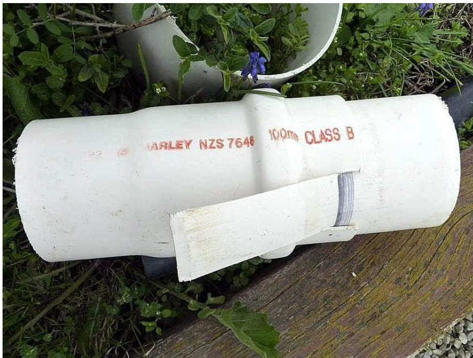
Figure 7: Reinsertion failure in thin walled PVC pipe

However, in thinner-walled PVC, a slight misalignment can result in the pipe intersecting the socket. This results in partial re-insertion while leaving a tag of material outside the socket (Figure 7). This will cause loss of pressure integrity in a pressure pipe but may not affect the performance of a gravity pipeline, especially if the tag is near the top and the line rarely runs full and is not subjected to liquefaction-induced silt intrusion.