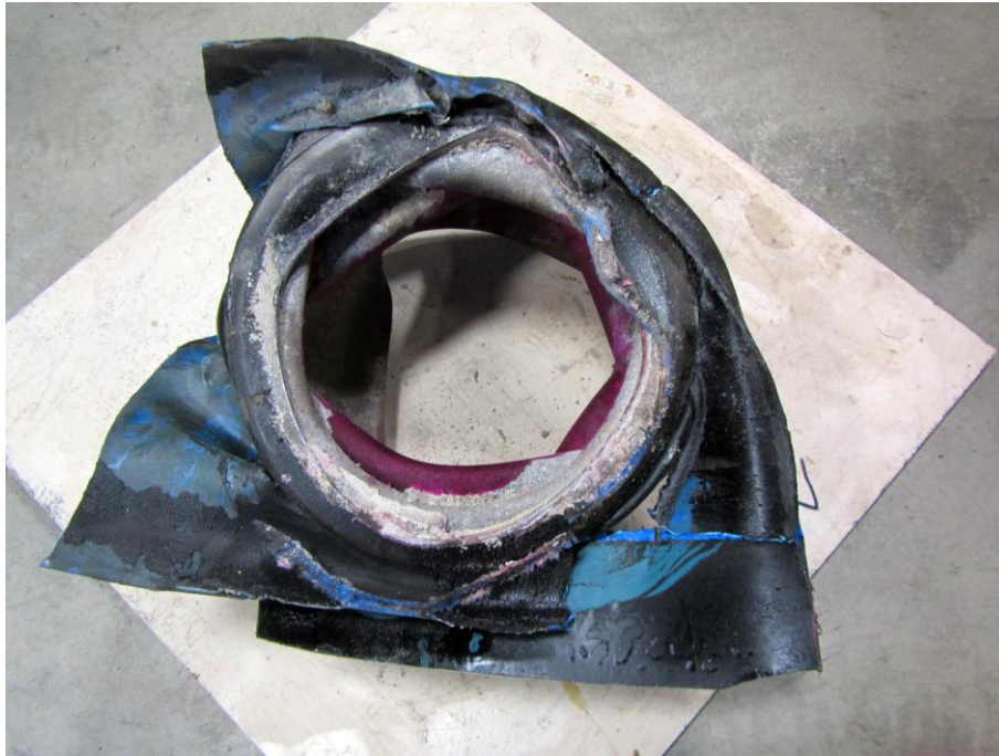
Figure 4: Buckled steel pipe after compression test. The external PE protection and the internal concrete lining are severely damaged but the weld has not failed and the pipe retains some functionality.

Three laboratory tests on DN160 PE drainage pipes showed two failures in bending and one in buckling at essentially identical loads, but in all cases there was some remaining free bore and in only one case was there evidence of damage that could have compromised longer term performance. There is also evidence that PVC water supply pipelines can retain some serviceability after severe bending (O’Callaghan, 2014). As with the steel pipeline, such damage could potentially go unnoticed, as there is no actual break or loss of service.