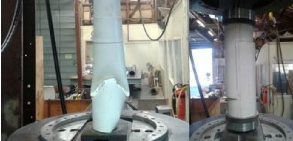
Figure 6: Thin-walled PVC that buckled after over-insertion (left) and intersecting PVC (right)

Another form of failure is observed where pipes have been alternately subjected to tension and compression with sufficient amplitude to completely separate the joint in tension (Morris et al, 2014). Where the spigot is partly pulled from the socket it can be reinserted under compressive loading. If, however, the spigot is fully removed from the socket, reinsertion requires perfect alignment. Any deviation, whether from vertical or horizontal displacement or bending, will either result in failure to re-insert or will cause damage to the pipe or socket. Fracture is especially likely in a brittle socket made of cast iron or Asbestos Cement but failure to re-insert would occur for any thicker-walled pipe whether brittle or ductile.