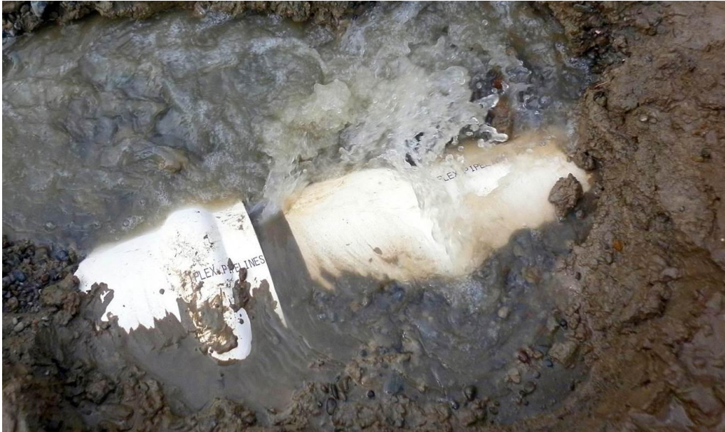
Figure 3: Pulled joint exposed to tensile loads

There are numerous reports of joint separation in spigot and socket jointed systems following earthquakes (for example, Dowrick, 1998, Leslie et al, 1987, Flores-Berrone and Liu, 2003, Cubrinowski et al, 2014). These reports confirm the expectation that tensile strain is not carried across joints. However, moderate displacement over many joints has been observed in more gradual soil settlements and could be expected where PGD occurs over a period of several days or weeks.