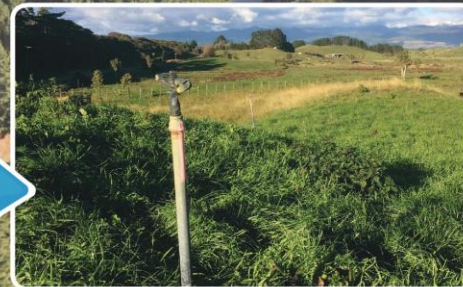
The Pot land treatment of wastewater by irrigation