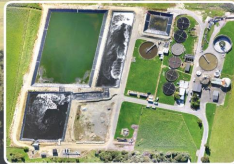
Levin wastewater treatment plant