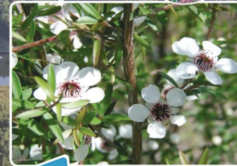
Diverse native plant ecosystem