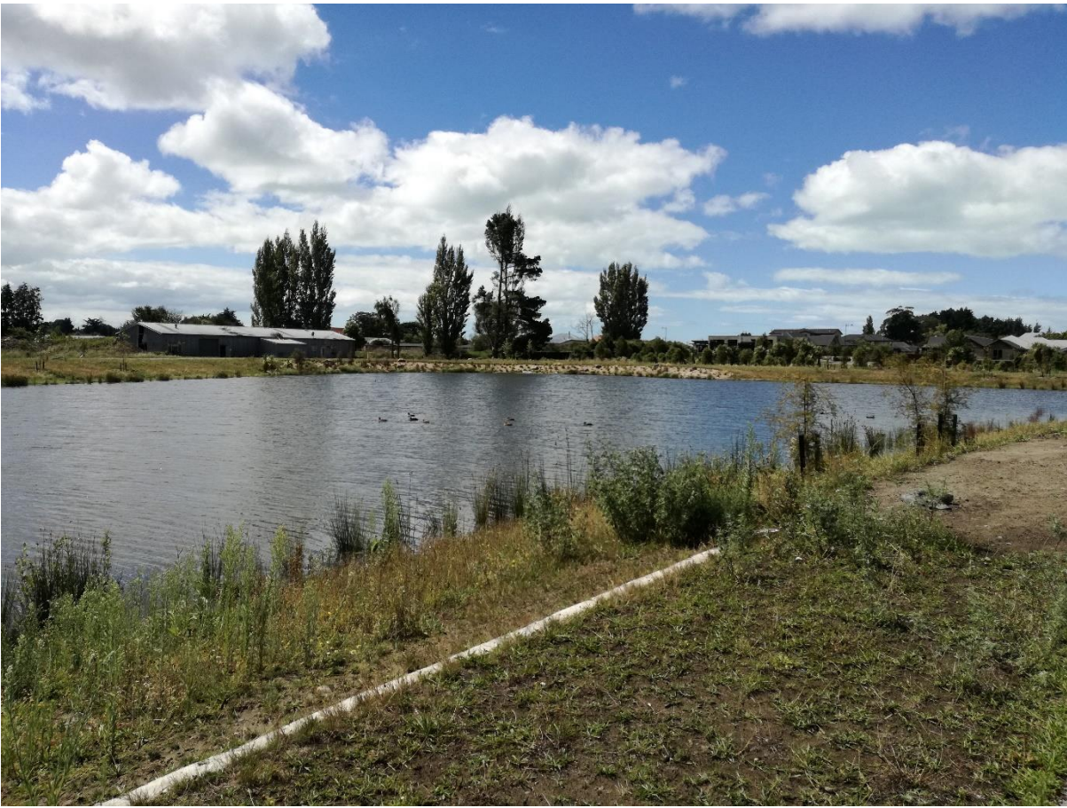
Figure 11: Prestons Park – Single large first flush basin. The overflow spillway is in the front adjacent to the inflow channel