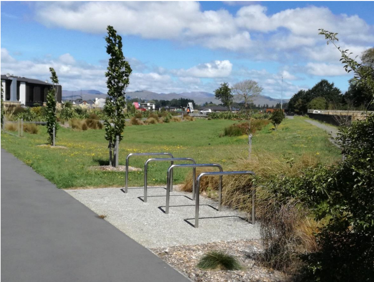
Figure 7: Dry First Flush basin in Prestons

Figure 7 below shows the dry first flush basin in Prestons with the wet attenuation basin on the other side of the footpath topped bund on the right. The development has included a café and seating / playground area overlooking this first flush basin.