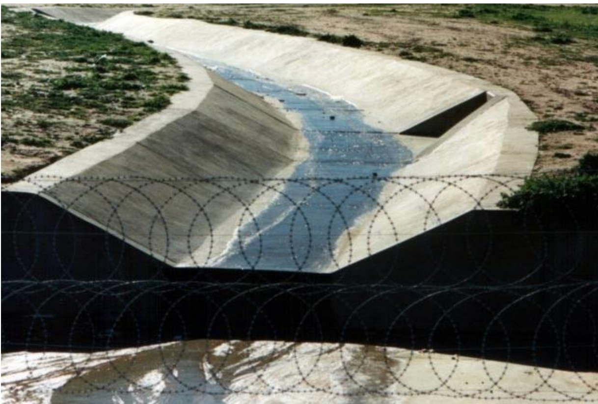
Figure 2: Example of an Engineered Conveyance channel

However, the purely capacity based engineered solutions aren't enhancing our urban environment, natural eco systems or creating amenity areas.