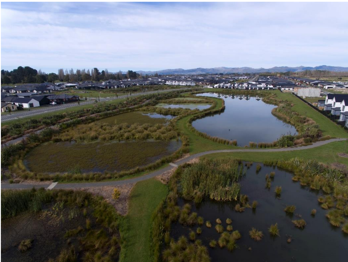
Figure 8: Prestons wetland cells (front and upper left) and first flush basin (upper right)

The end result did require some redesign but achieve an agreed outcome which can be seen now as an asset from an infrastructure and an amenity perspective. Some pumping of water from the first flush basins higher in the catchment was required during the first summer or two until the plants were established.