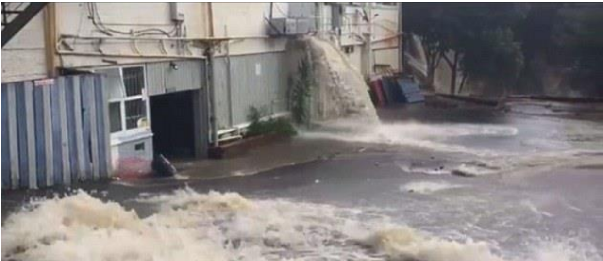
Figure 1: Flood water exiting some commercial buildings in New Lynn, Auckland

Figure 1 below shows flood waters exiting some commercial buildings via a rear access door in New Lynn in West Auckland recently.