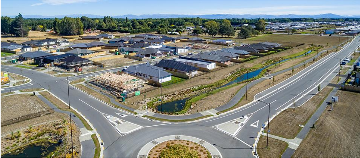
Figure 9: Prestons Park – vegetated open channel

The single large first flush basin provided the ability to fully attenuate the initial stages of development while the Clare Park wetland and conveyance upgrades was designed and constructed.