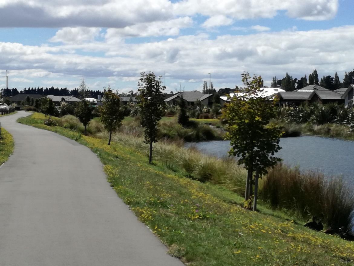
Figure 6: Wet First Flush basin in Prestons