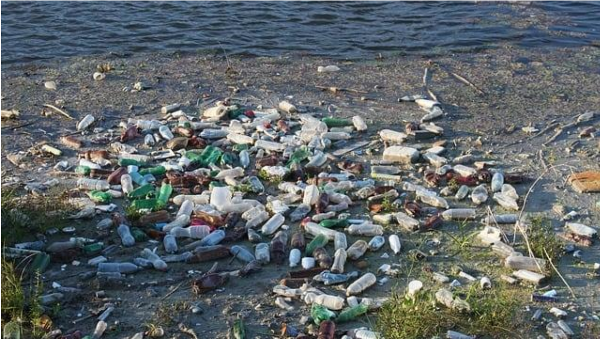
Figure 3: Water transported pollution

However, in modified landscapes this is accelerated, and additional unnatural contaminants or levels of contaminant are also transported. From Urban areas this includes rubbish and chemical contaminants from vehicles and industries, and higher concentrations of sediment from more erodible surfaces.