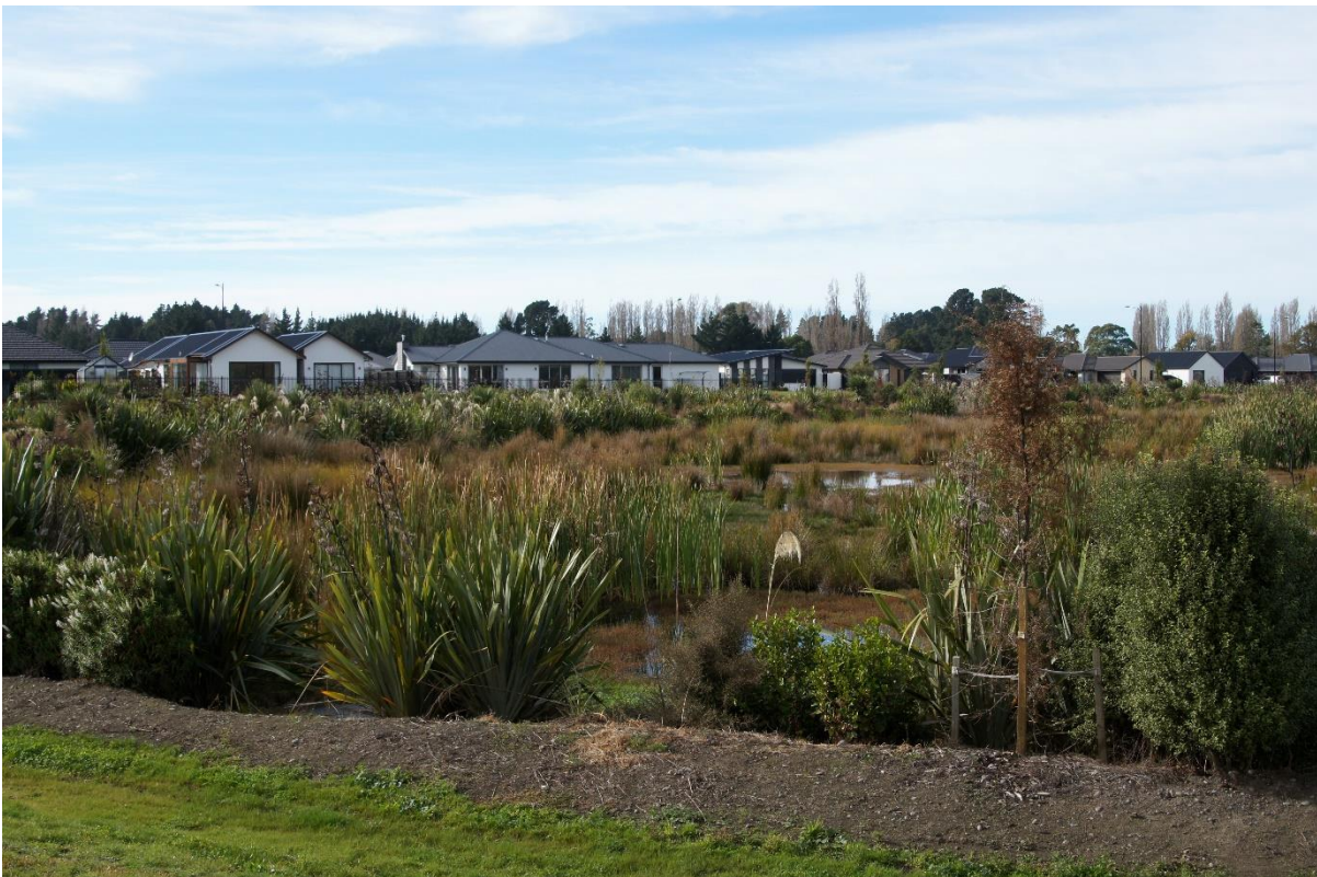
Figure 13: Prestons wetland