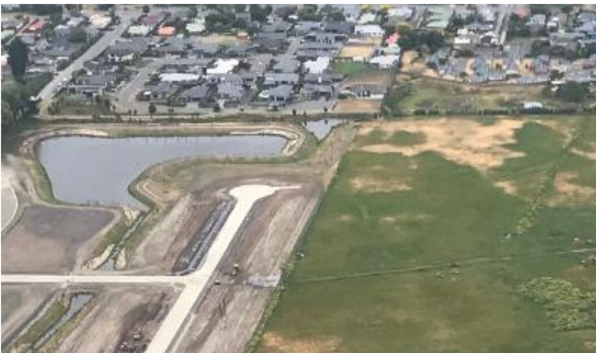
Figure 10 Prestons Park First Flush Basin with overflow spillway and bypass channel.

The low flow outlet from the first flush basin is at the far end of the basin, however the overflow spillway, for when rainfall exceeded first flush volumes, is located adjacent to where the vegetated open channel discharges into the first flush basin. This allows for overflow to leave the site via a separate bypass channel and not flow through the first flush volume, remobilizing sediment.