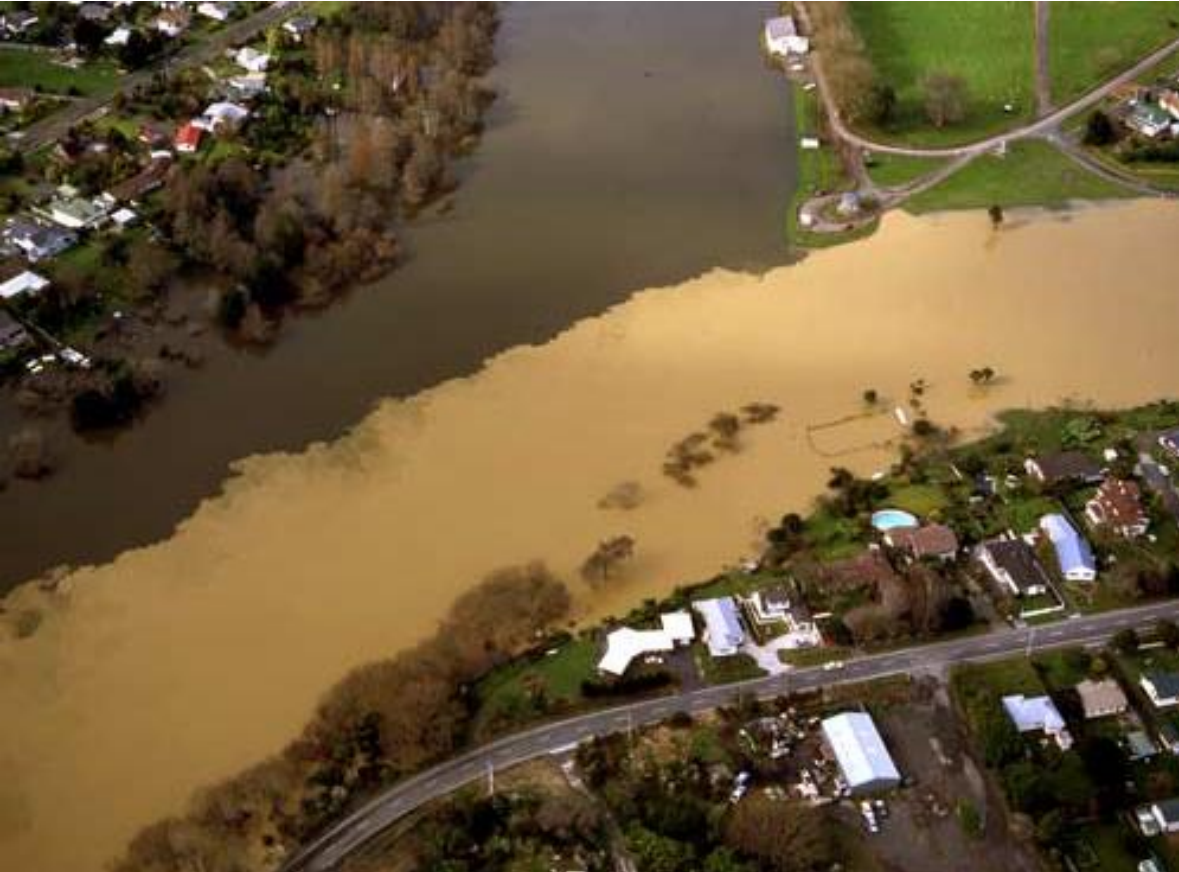
Figure 4: Sediment flows

While these two photos are more extreme examples, this type of pollution can occur incrementally with a negative result on our ecosystems.