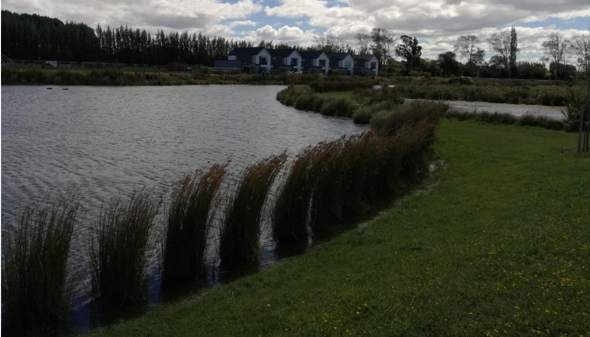
Figure 12: Prestons - Larger first flush basin (left) and wetland cell (right)

Visually there is no argument that the result is an enhancement of the new built environment with a variety of plantings, open water spaces and connections to walking and resting areas.