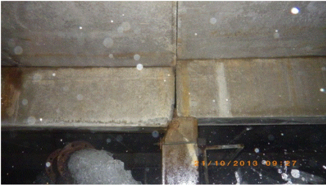
Photographs 4, Internal views of Karapiro 1