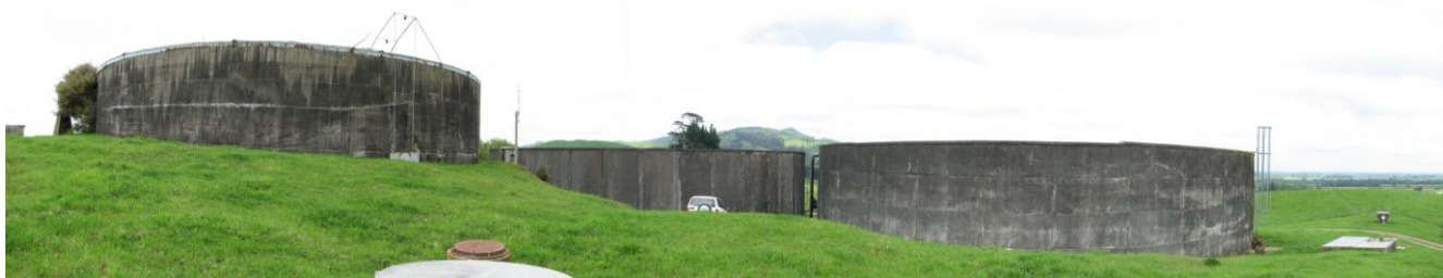
Photograph 1, general view of reservoirs