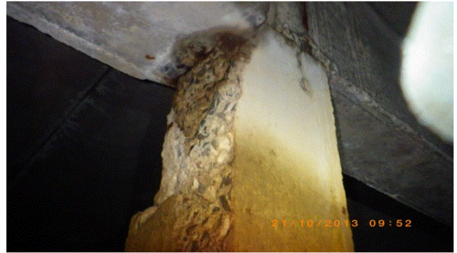
Photographs 5, Internal views of Karapiro 2