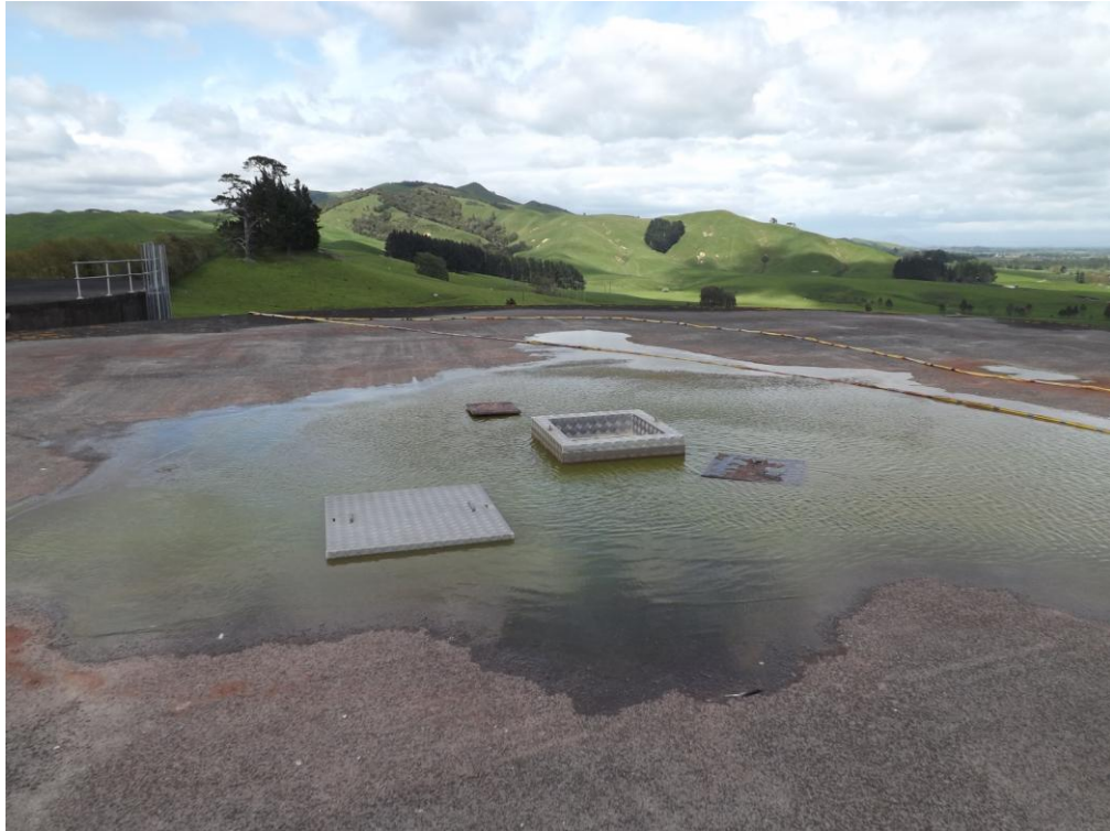
Photograph 3 of roof ponding Karapiro 2 at time of survey

The findings and recommendations from the various reservoir surveys were analysed and works programmes put in place to initially address any high Health and Safety issues identified. With regard to Karapiro reservoirs 1 and 2 the decision was made to incorporate internal inspection of the reservoirs with a de-grit operation being planned for late 2013.