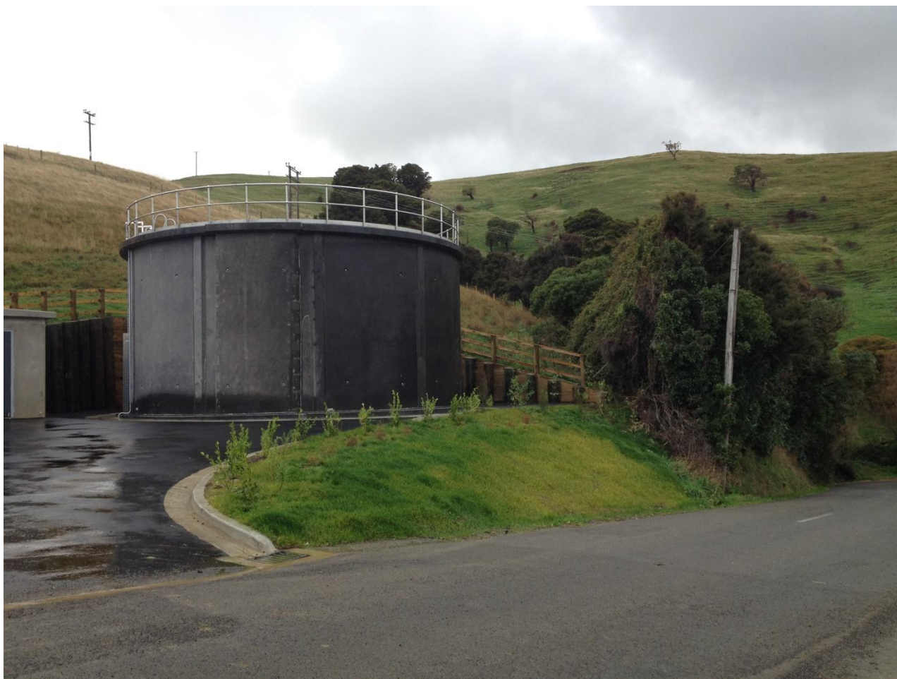
Photograph 2: New Takamatua Reservoir