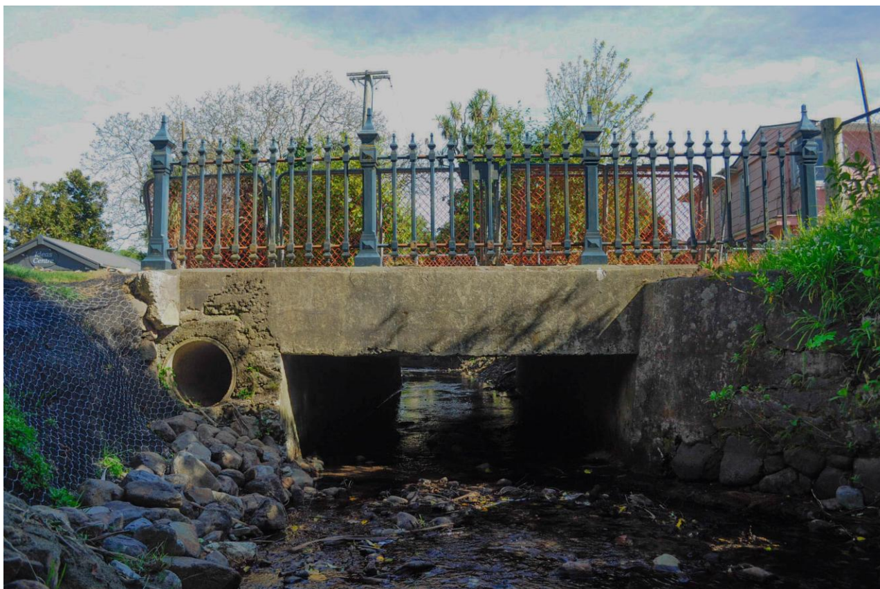
Photograph 3: Historic Bridge Along Akaroa Pipe Route

Heritage NZ has a register of significant historic features across New Zealand, including numerous features in Akaroa. On this register were three bridges that the new pipelines needed to cross, so the design proposal for taking the pipelines across the bridge was presented to Heritage NZ for their acceptance. The proposed design consisted of an encasement pipe along the outside of the bridge. Heritage NZ objected to this proposal on the basis of aesthetic effects on the historic structure and a revised proposal to run the pipes under the seal across the deck of the bridge was agreed.