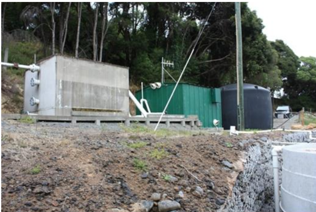
Photograph 1: Takamatua Water Treatment Plant before the Upgrade