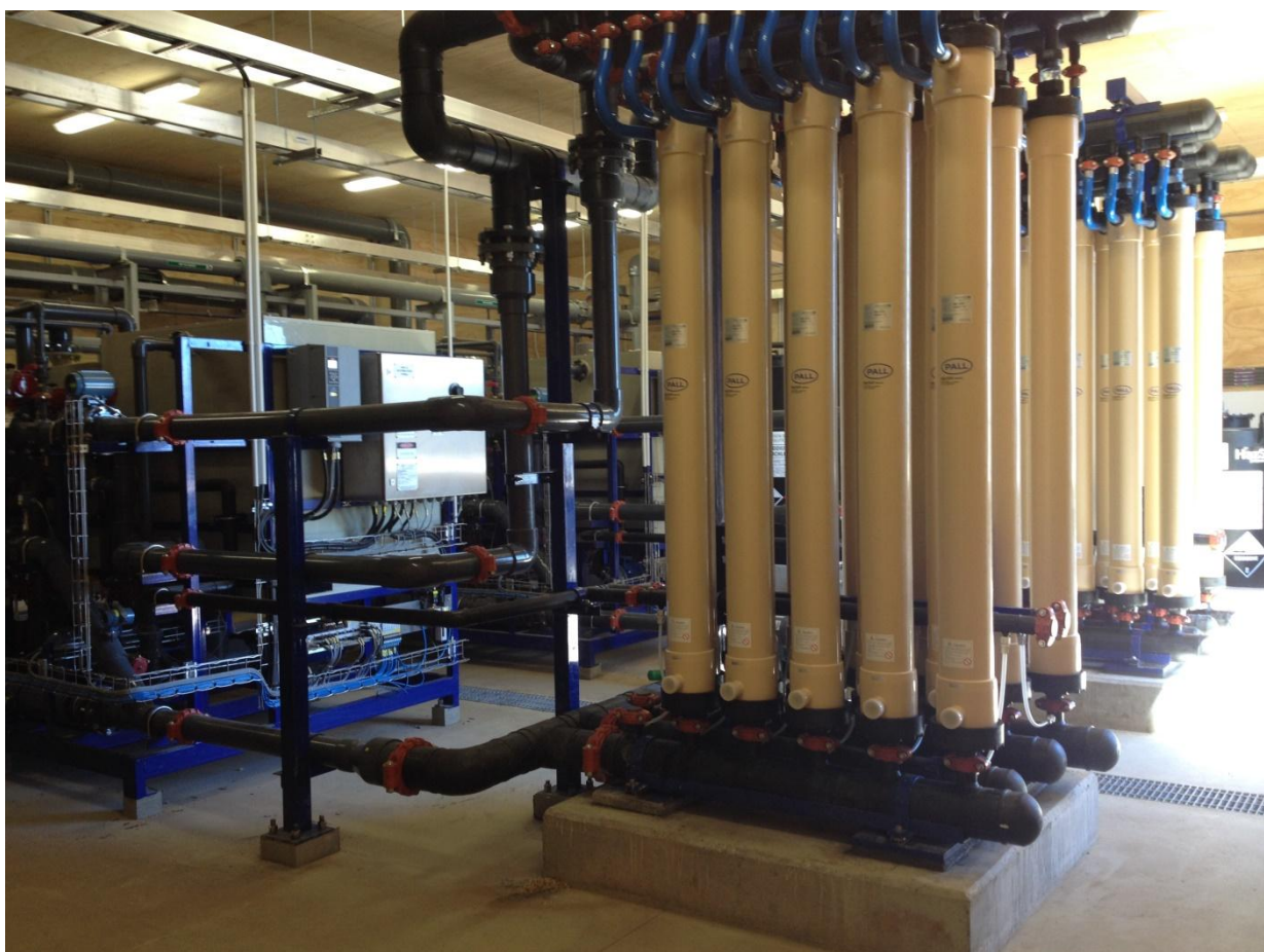
Photograph 4: New L'Aube Hill Membrane Plant

The extended commissioning and trial operation period (CCC elected to abandon the Operational component of the DBO contract) proved beneficial in terms of allowing more time for operator training and experience. The City Care operators that are responsible for operation of the new WTP on behalf of CCC had worked on conventional treatment plants in the area for many years. The transition from operation of largely manual conventional plants to highly automated membrane treatment has required the operators to undergo a steep learning curve. Membrane plants require more process optimisation and the operators need to take the time to monitor and understand how the plant reacts to different water combinations.