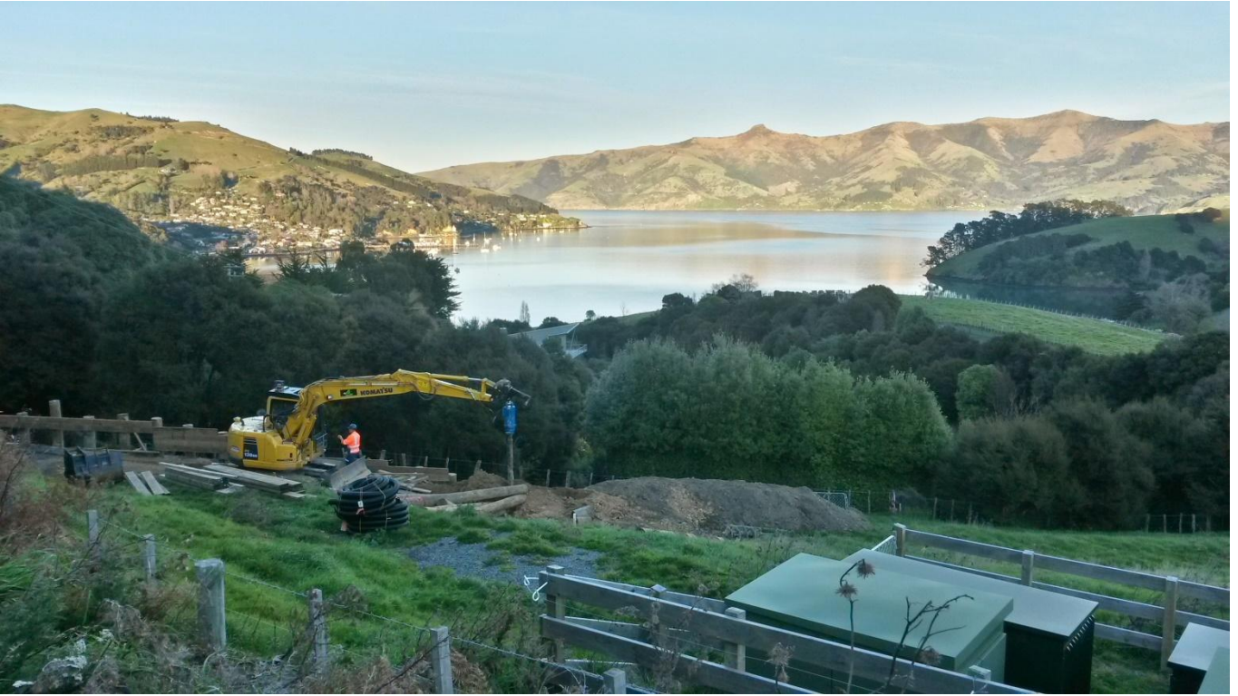
Photograph 5: Another Beautiful Day Constructing in Akaroa