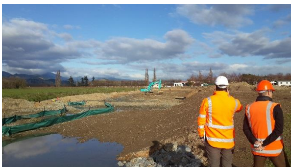
Photographs 5 & 6: Before and After Formation of Borck Creek

Meeting the Tasman District Council Engineering Standard of providing 250mm of freeboard also proved difficult to achieve along the full length of the widening due to batter height variability between cross-sections (due to ground variability along the old Waimea Flood Plain). A conservative approach was taken to generally provide the full capacity at the cross section with low points in the batters or install bunding to fill in old flood channels.