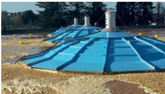
Figure 2: Floating Surface Aerator with Acoustic Cover and Motor Silencer

Aeration System – Most aeration systems used are based on floating mechanical surface aerators. Over the years they have proven to be reliable, with low maintenance requirements and an constant oxygen transfer efficiency over time. Downsides are that they are a significant contributor to the noise budget and on windy days spray drift can cause a nuisance.