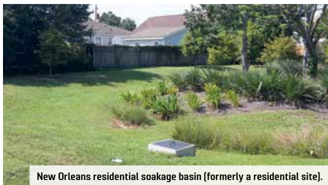
New Orleans residential soakage basin (formerly a residential site).

“They have admitted it was a manmade disaster and are going to get used to living with nature rather than working against it.” WNZ