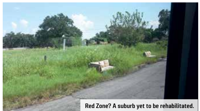
Red Zone? A suburb yet to be rehabilitated.