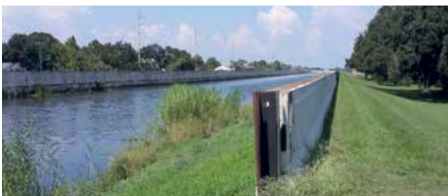
Typical New Orleans levee construction – many failed due to piping and scour under the concrete walls, or over-toppling of the walls due to the hydraulic lateral load.

One of the museums had an exhibition on the hurricane, which he visited during some downtime and there were models demonstrating the impact of the loss of estuarine,