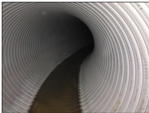
Figure 2: Rotaloc liner installed continuously around a bend in a 1,550mm nominal diameter conduit

One of the first applications of Rotaloc bend profile strip was on a 1,550mm nominal diameter conduit in Auckland. The bend extended over 90° with a radius of about 15 metres.