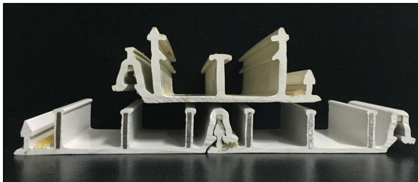
Figure 3: 22mm high steel reinforced Rotaloc has almost 3 times the stiffness of 37mm high standard Rotaloc

Steel Rotaloc expands the capacity of this system to structurally line larger diameter pipelines. Installation by the Rotaloc process, tight against the bore of the deteriorated pipeline, maximises the lined diameter and removes one of the limitations of Ribline.