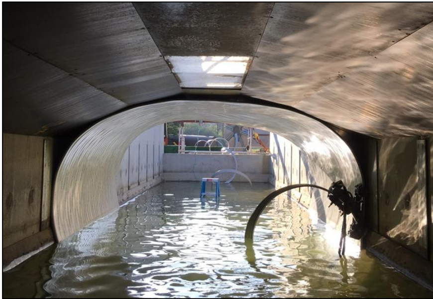
Figure 5: Machine Spiral winding of the liner in a simulated conduit with the required dimensions, demonstrating that installation is possible in partially submerged conditions.

With the liner having to be grouted in stages, it is possible that grouting the invert and sections of the vertical liner walls will provide the structure with enough stiffness so that no further support is needed to allow successful grouting of the critical soffit section.