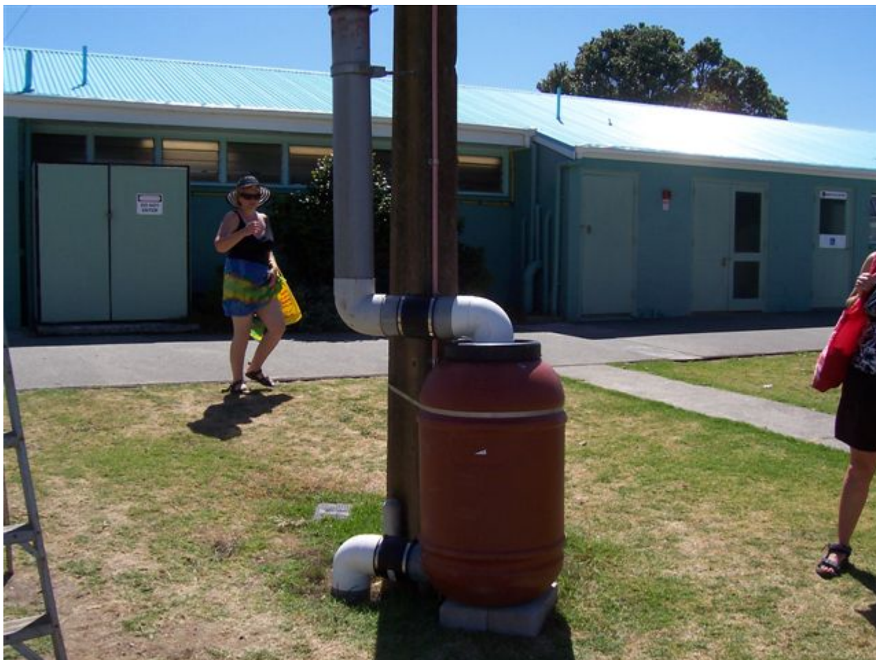
Photograph 1: 'Rapidly Deployable' Carbon Filter on Pump Station Vent Stack at Martins Bay Campground

Martins Bay Campground, at the Eastern end of the Mahurangi Peninsula, overlooking Kawau Island, enjoys a significant influx of campers over the summer holiday period. While the existing pump station is planned for replacement, the sharp spike in summer flows cause odour issues. An existing small carbon filter was not adequately dealing with wet-well air flows. A 'rapidly deployable' carbon filter was cut into the wet-well vent stack increasing the residence time of wet-well air flow and effectively dealing with the odour issues.