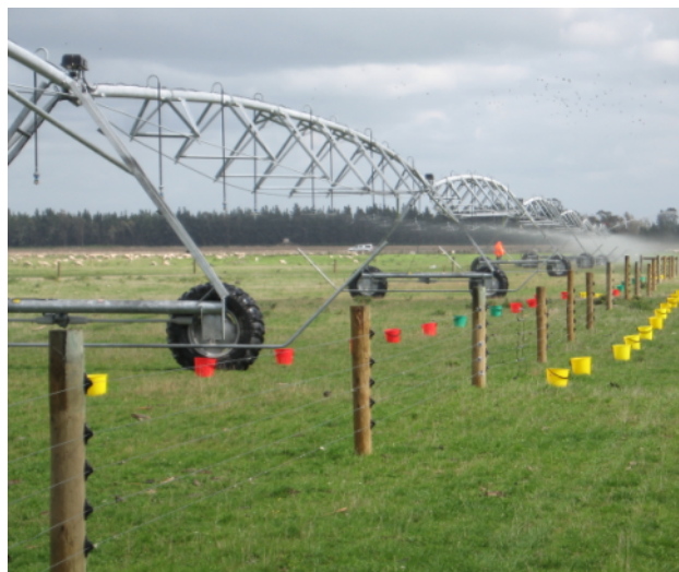
Figure 3b – Cans laid out from the end of Tower 1