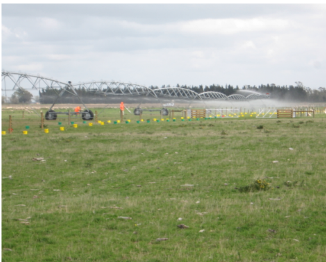
Figure 3a. – Pivot run before getting to the cans