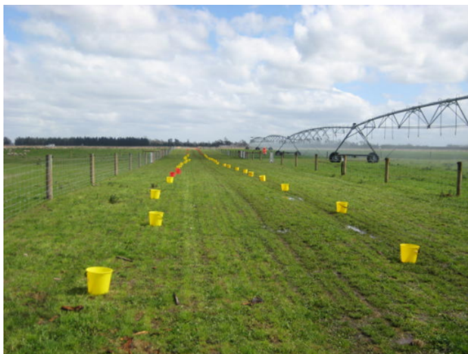
Figure 3f. – Volume measurements started from the end of the pivot