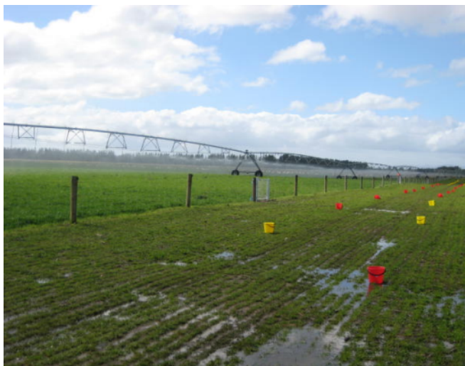
Figure 3e. – Ponding observed in places