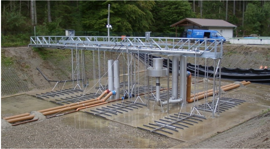
Figure 2 : CWSBR® is a full performance SBR process in the shape of a pond technology, which grants highest wastewater treatment standards.

CWSBR® grants full SBR performance including nitrification, denitrification, phosphorus removal by Bio-P and fully stabilized sludge. The attribute typical for SBR technology, highlighting that the treatment success is independent from the plant size also applies for the CWSBR® systems. To date new plants sizing from 800 PE to 210.000 PE were designed and constructed. Upgrades of existing ponds and lagoons were carried out from 5.000 PE to 10.000 PE by retrofitting and extending existing wastewater ponds (figure 2/3).