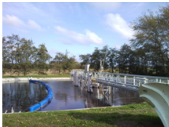
Figure 5 : CWSBR® Control Bridge and Hydrosail separating activated sludge zone from clear water zone