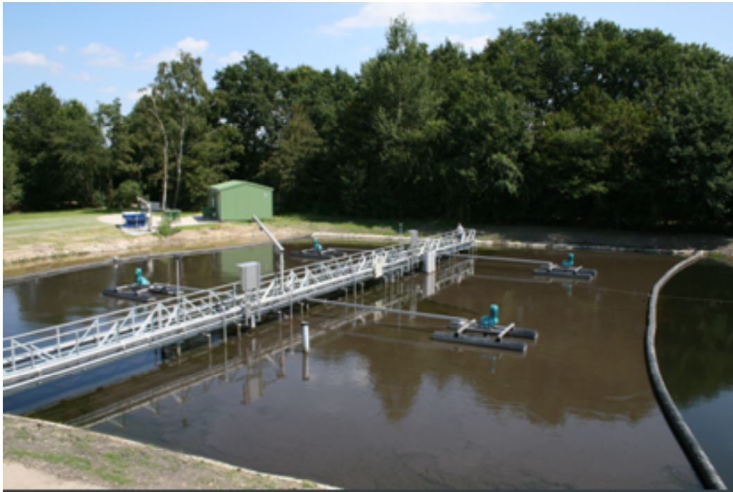
Figure 3 : CWSBR® System under running conditions, showing aerated zone.